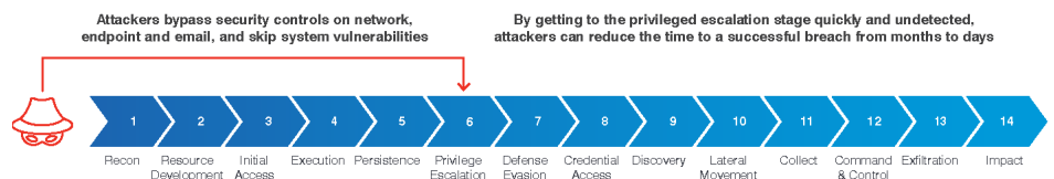
Figure 1. Attackers now focus on vulnerable identities as a key path through the attack chain.

Unlike other tools, Shadow doesn't rely on analytics based on signatures or behaviors. It also doesn't use agents or honeypots that can be bypassed. Instead, Shadow's agentless architecture allows the deceptions to operate quietly, while appearing to be authentic. Shadow has successfully defended against more than 160 red team exercises with some of the top security organizations in the world, including Microsoft, Mandiant, the U.S. Department of Defense and Cisco.