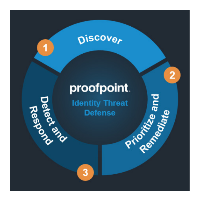
Figure 2: Proofpoint Identity Threat Defense platform.

Proofpoint research shows that 1 in 6 enterprise endpoints, both clients and servers, contain identity vulnerabilities. And this is even when traditional identity and access management (IAM) solutions are in place. Attackers exploit these vulnerabilities to gain access to admin privileges. When they first land on a host, that host is rarely their end target. They seek to move laterally within the network